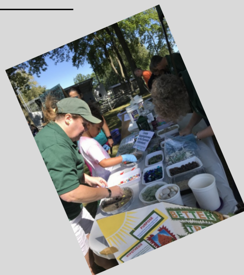
Making the stones with sea glass and beads and stones found around our area