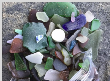
Sea glass for the stepping stones

Come and take a walk Through the Arboretum and see these beautiful additions to our town.