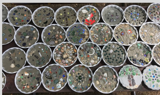
Over 65 stepping stones were made