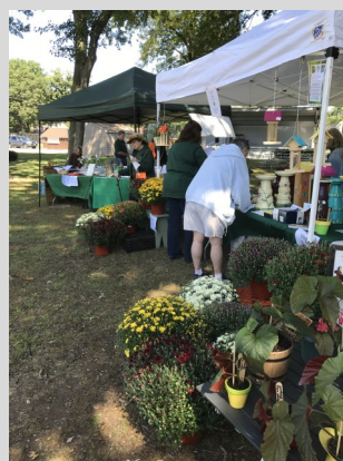
A vibrant DSTC booth for Dumont Day