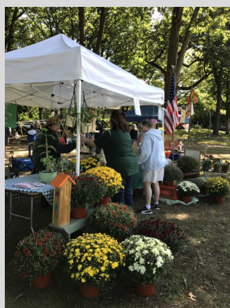
Beautiful Mums sold out fast!