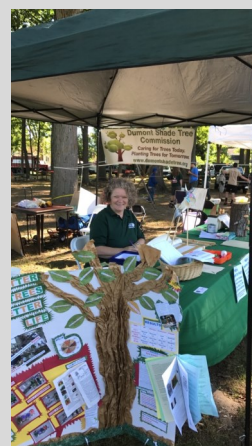
Commissioner Abbie at our booth